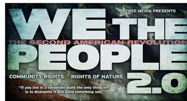
“We the People 2.0” November 9th