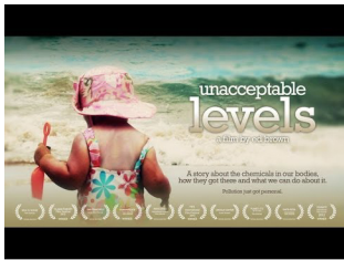
“Unacceptable Levels” September 14th

Admission: Open to all, students encouraged and incentivized Documentaries to be screened: