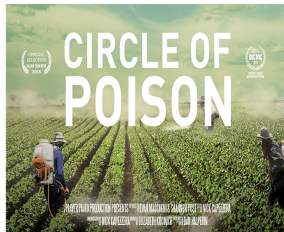
“Circle of Poison” October 12th